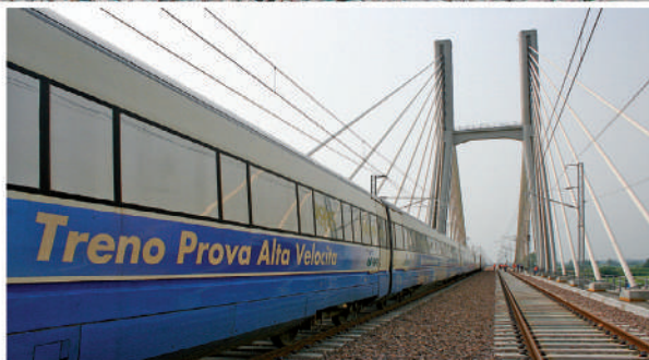
HS Test Train ETR500Y1

Italcertifer has been accredited as "Inspection Body" pursuant to the EN17025 and EN45011 Norms.